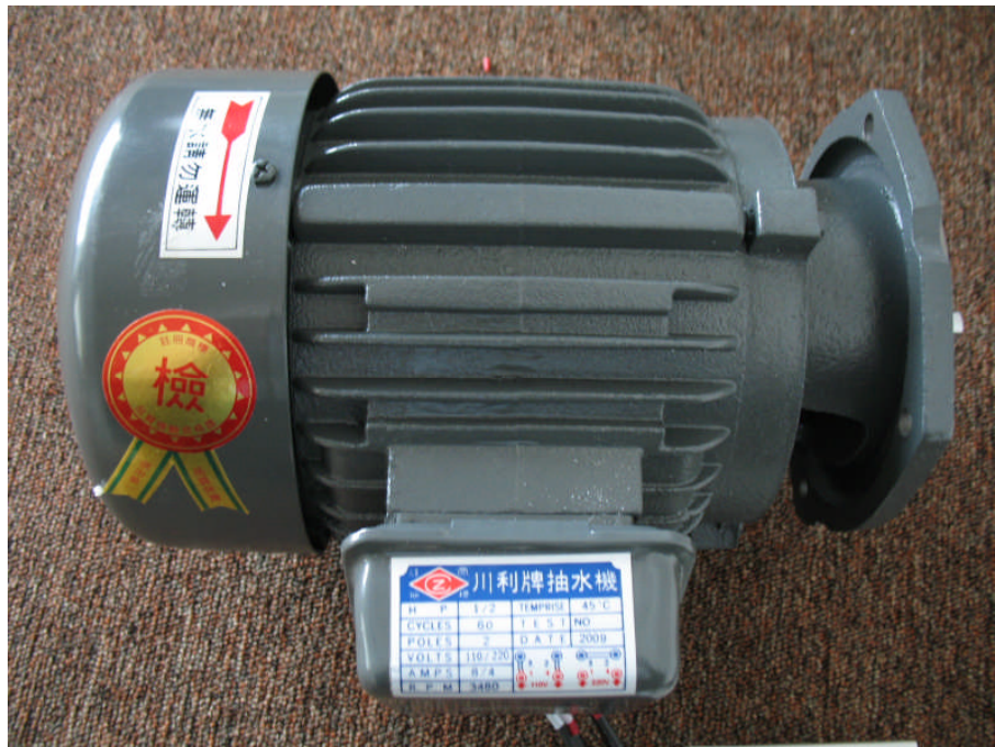
Loading: 1/2 HP Motor